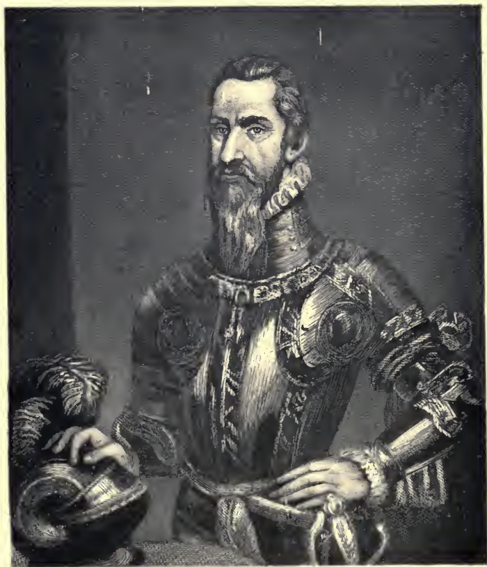
DON FERNANDO ALVAREZ DE TOLEDO, DUKE OF ALBA.